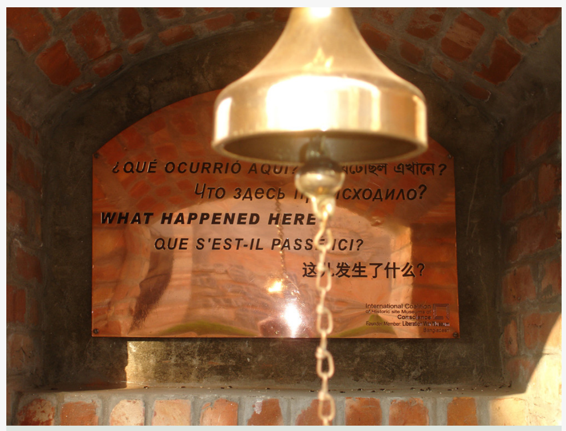
A plaque at a killing site in Bangladesh sponsored by the Liberation War Museum.